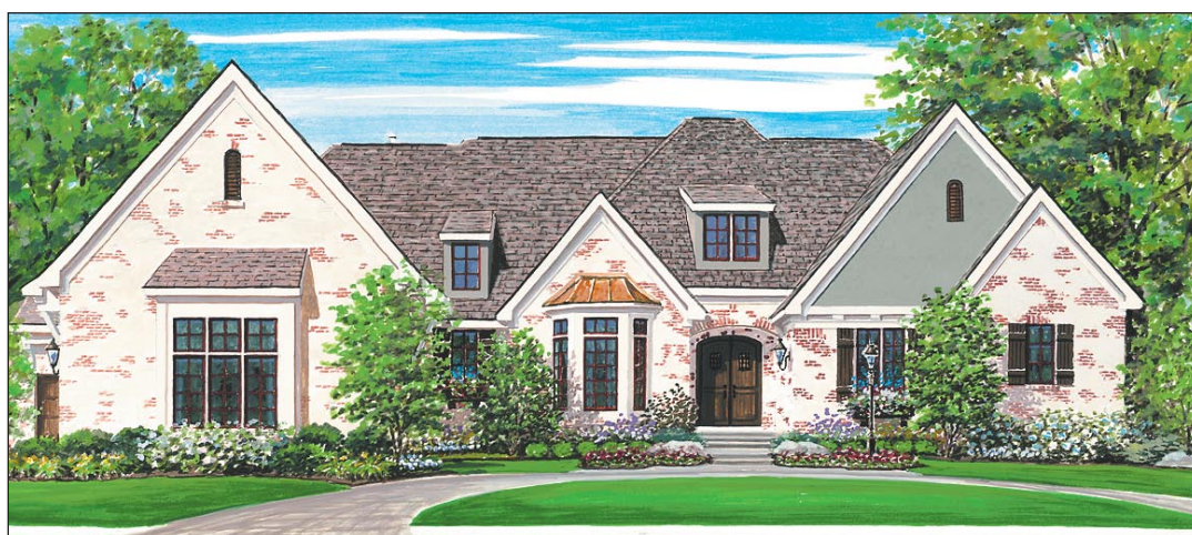
A weathered brick exterior brings an Old World look to this modern luxury home by Campbell Custom Homes.

More information is available about the Indiana Grantmakers Alliance at www.indianagrntmakers.org and about MIBOR at www.mibor.com .